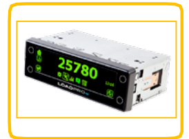
DIN Radio Version

Connection to third party tracking systems is easily achieved via the LoadPro system's standard telematics output.