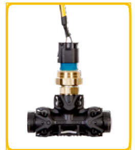
Air Pressure Transducer

5920 South 194th Street | Kent, WA 98032 | USA Ph: Toll Free 800-237-0022 or +1-919-219-6471 E-mail: obw.us@vpgsensors.com